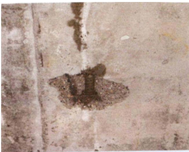
Soffit of slab showing pre-stressing duct

CROSS comments: Grouting of pre-stressing ducts requires careful workmanship and supervision. Recent investigations have revealed the likelihood of a lack of properly grouted ducts in some buildings. One method of minimising the risks is to ensure that post tensioning installation is only carried out by properly trained teams, for example those certified for PT installation through the UK CARES certification Scheme. It should be noted that point 4 above (water ingress and freezing) can occur in completed structures where grouting has not been properly executed. An excellent guide on procedures and techniques is given in the CARES note distributed in June 2008 and now put on their web site: ( www.ukcares.co.uk/PDF/CARES_Post-Tension%20Leaflet.pdf ). Reference is made to the need for project specific reviews and advice is given for new structures. (Report 089)