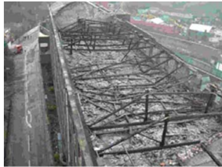
Roof after fire damage

storey section. The straight joint in the masonry walls probably contributed to the sudden collapse. Onlookers, including the reporter, were surprised by the speed and extent of the collapse. Although no one was injured there was considerable damage to neighbouring houses.